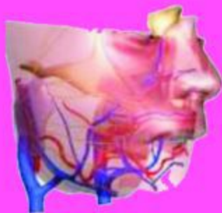
Microvascular Free Flaps