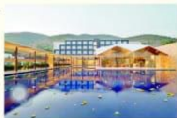
HOTEL MARASA SAROVAR