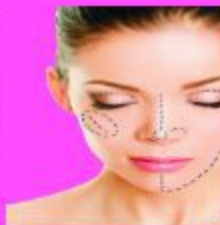
Facial Aesthetic Surgeries