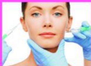
Live Demo of Botox & Dermal Fillers on Patient